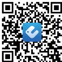
App Download Linkage

Scan the QR code or search "Ewpe Smart" in the application market to download and install it. When "Ewpe Smart" App is installed, register the account and add the device to achieve long-distance control and LAN control of smart home appliances.