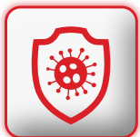
UVC & Ionizer