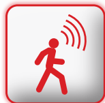
ECOPILOT Motion Sensor (follow/avoid)