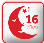
Ultra Silence Mode 16dB(A)