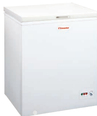
Artic Air INVMCF142A