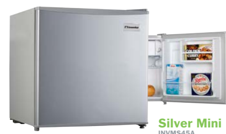
Silver Mini INVMS45A

Light & simple design, compatible with every type of kitchen. Includes adjustments for maintaining correct humidity. Excellent food and vegetables preservation with less consumption and greater performance among the same models in the market