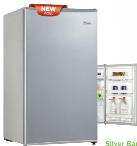
Silver Bar INVMS93A