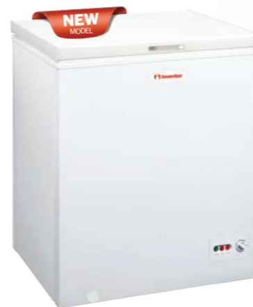
Ice Box INVMCF295A