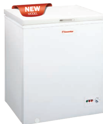
Ice Pop INVMCF198A