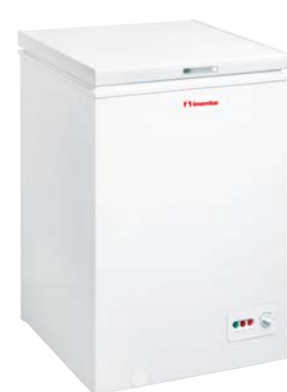
Crystal Air INVMCF99A