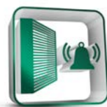
Filter Cleaning Reminder

The increased air output contributes in dealing with humidity even in the remotest corners of the house, on the ceiling or at areas that have been affected by humidity for a long time. The upgraded Turbo mode will untie your hands with the drastic changes that not only promises but does make, since it is proved that it can restore humidity levels in a flooded basement, or a place that hasn't been reached for months. Enabling the Turbo mode, creates a comfortable and healthy environment in zero time!