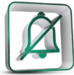
Low Noise Level