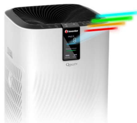
Air Quality Indicator

A clean and healthy atmosphere in your area is ensured, due to the highly effective 6 filtration stages and the Ionizer. These high filtration levels withold 99,97% of all particles larger than 0,3µm, providing an impeccable air quality, while the Ionizer produces Ions which eliminate odors, dust and smoke.