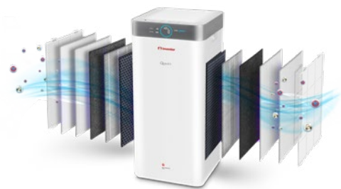
Double Filtration System