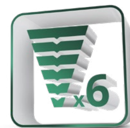
6 Air Filtration Stages & Ionizer