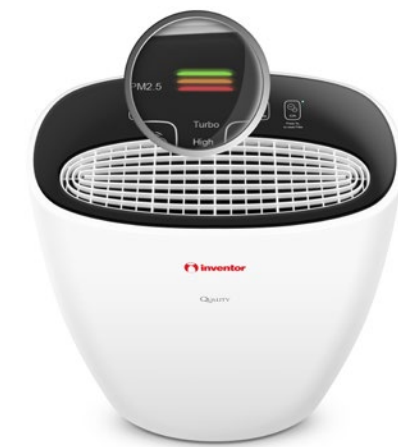
Air Quality Indicator

The radical HEPA filter (class H11) with the ability to withhold a percentage of 97,5% of particles with size up to 0,3µm, guarantees an excellent air quality in your place. Enjoy a clean atmosphere in your house and reduce radically the possibilities of allergic reactions with the valid certification of the European Centre for Allergy Research Foundation.