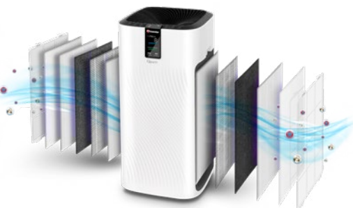
6 Air Filtration Stages & Ionizer